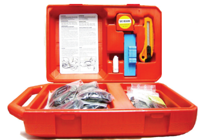
Figure 1.1 Splicing Kits available

We can also supply standard spicing kits in Viton® and Nitrile, however, other materials can be provided.