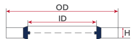
Fig 1.2 Self-entering bonded seal type

“ We are dedicated suppliers of high quality products . Certificate of Conformity comes as standard , and we offer special labelling and bagging services. ”